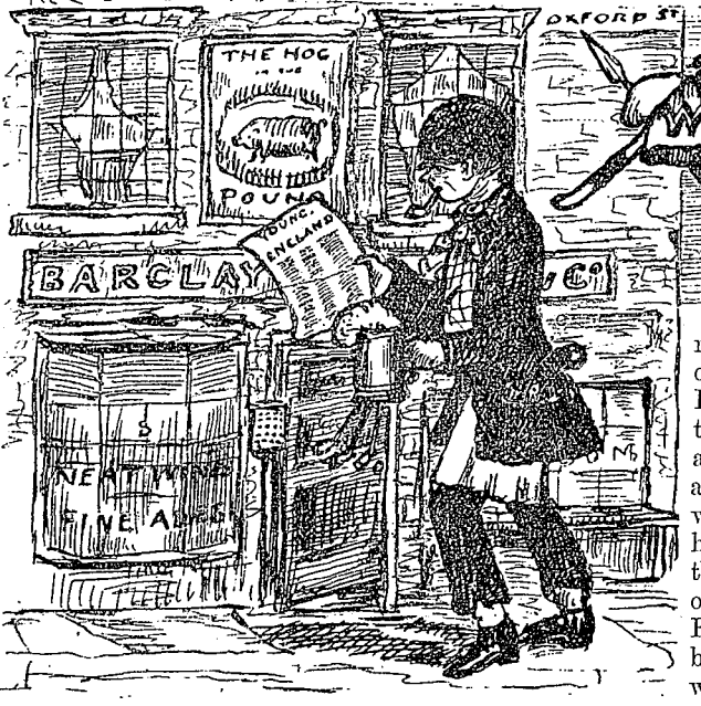
WITLESS AS THE MODERN BRUTUS.

"The judges all ranged; a terrible show."—Beggar's Opera.