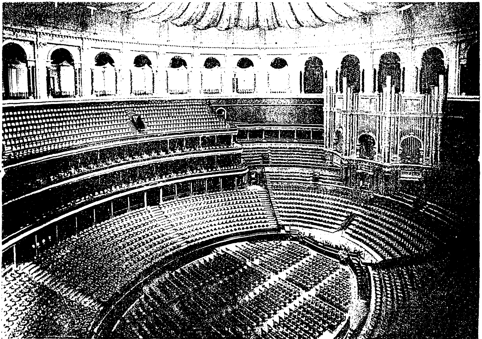
INTERIOR OF THE ROYAL ALBERT HALL.