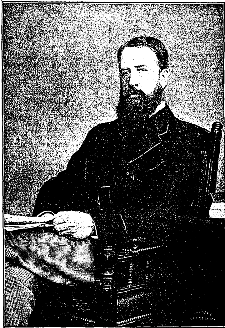
HIS GRACE THE DUKE OF DEVONSHIRE, K.G., THE CHAIRMAN.