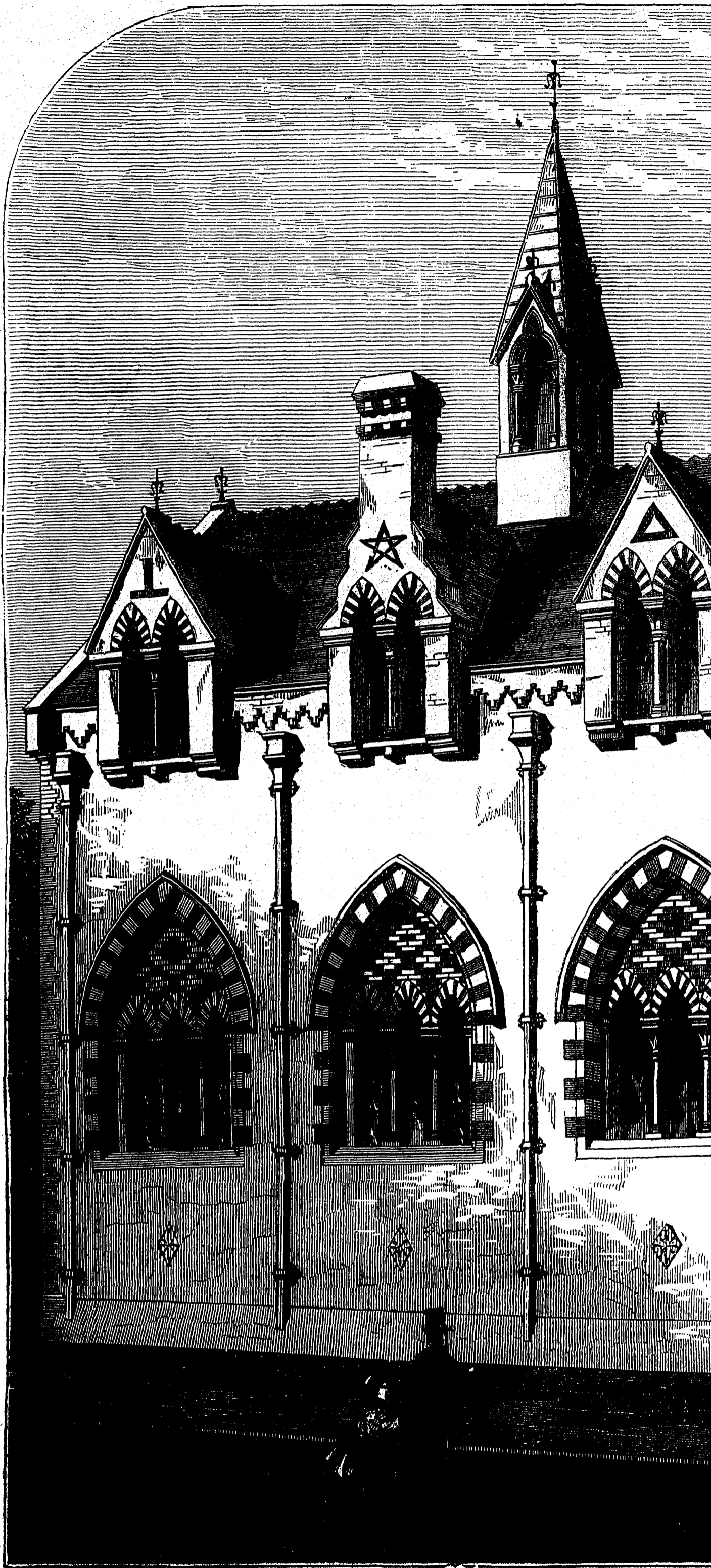
BUILDING FOR THE FREEMASONS!